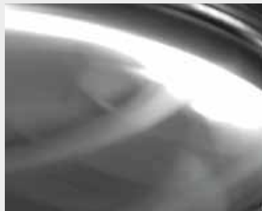
BRIGHT-POLISHING Roughness down to 0.02 μm