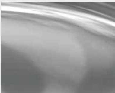
SATIN POLISHING Grain up to 600 or Scotch-Brite™